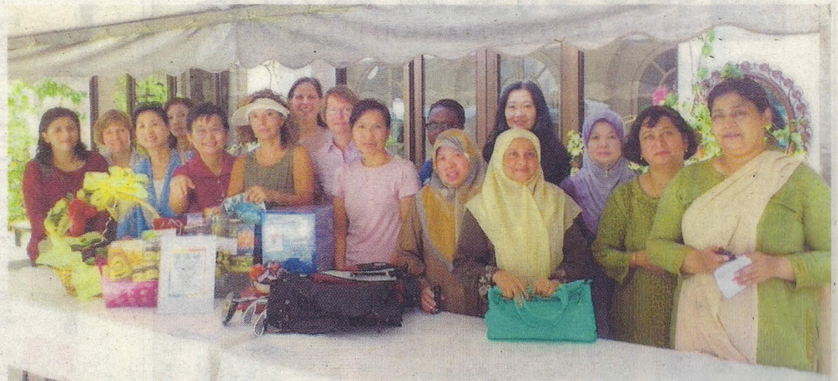
Strong support: Sohom members setting up for the bazaar at the Italian Ambassador's Residence. Over 40 countries are represented.