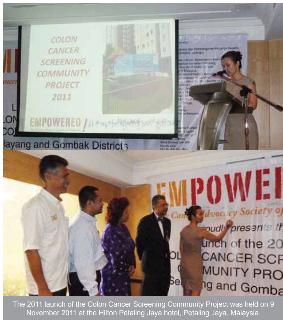
The 2011 launch of the Colon Cancer Screening Community Project was held on 9 November 2011 at the Hilton Petaling Jaya hotel, Petaling Jaya, Malaysia.