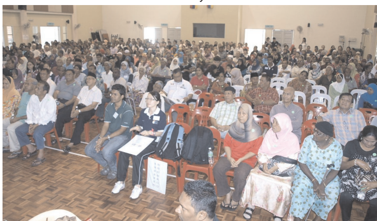
Bottom: Workshop participants listening to opening speeches in Dewan PPR Taman Wahyu