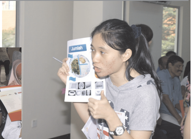
Left: Participants listening attentively during the breakout workshop.