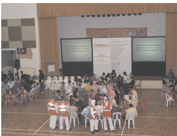
Left: Breakout groups in Malay and Chinese, educating about colon cancer, how to use FIT kit, nutrition and exercise